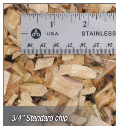
3/4" Standard chip