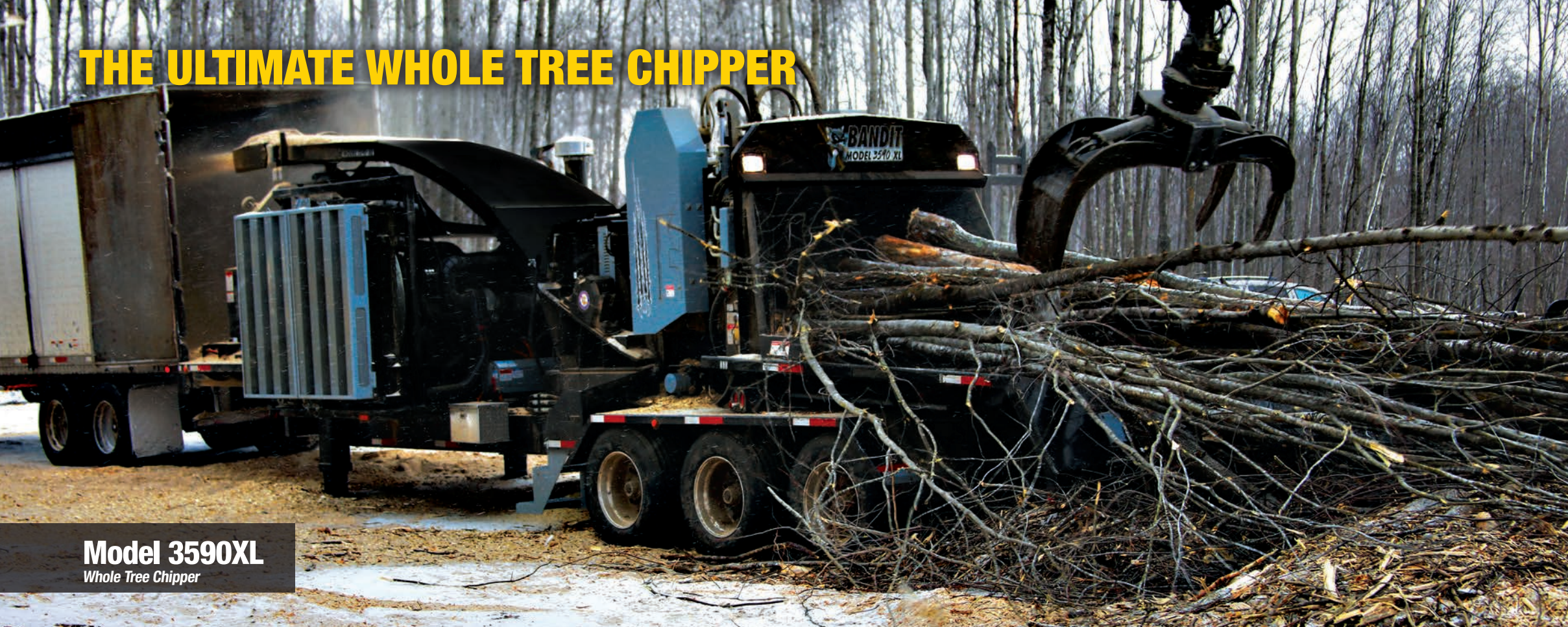
Model 3590XL Whole Tree Chipper