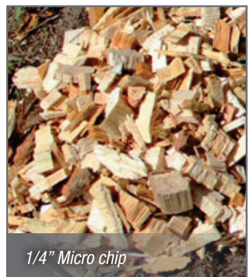
1/4" Micro chip