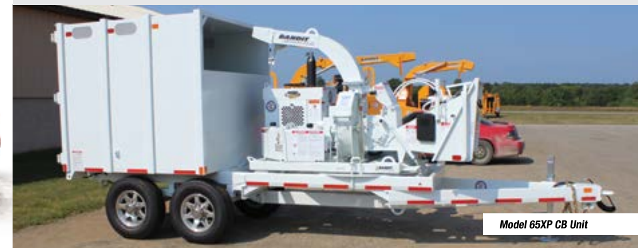
Model 65XP CB Unit