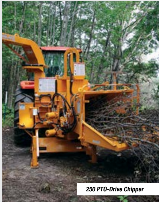
250 PTO-Drive Chipper